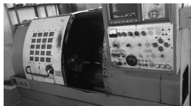
Figure 1: CNC lathe

The Taguchi method was used for determining the number of experiments. 15 The Taguchi method provides an experimental design, involving orthogonal arrays, to organize the parameters that affect the process and its different levels. Since factorial design consumes more time and resources, the L9 orthogonal array is a more effective method than factorial design. Unlike the factorial design where all possible combinations are tested, only pairs of combinations are tested with the Taguchi method. This helps us determine the factors that affect the product quality using the minimum number of experiments. So, it saves time and resources. Here, the Taguchi L9 orthogonal array is chosen, as there are three